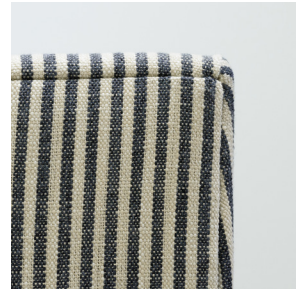
DOVER STREET SETTEE 48W X 19.5D X 30H