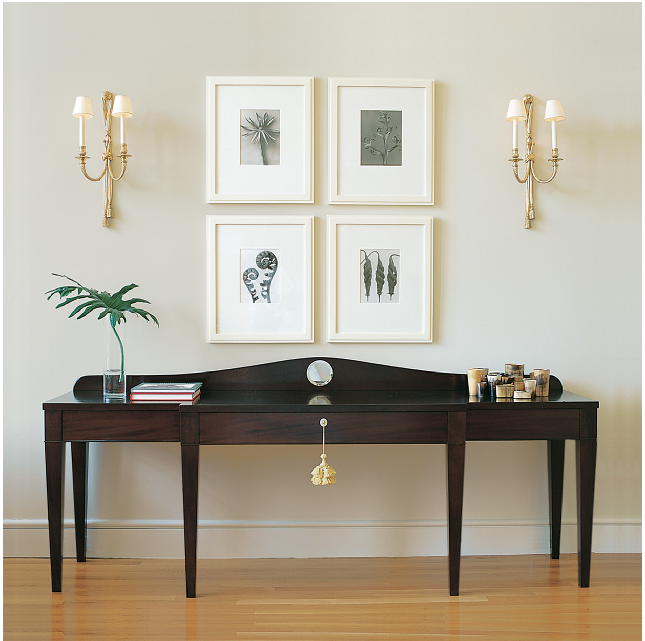
GRANDE SALON TABLE 96W X 24D X 33.5H, 40 OAH