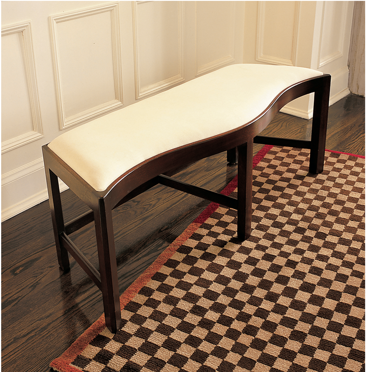
SERPENTINE BENCH 48W X 15.5D X 18H