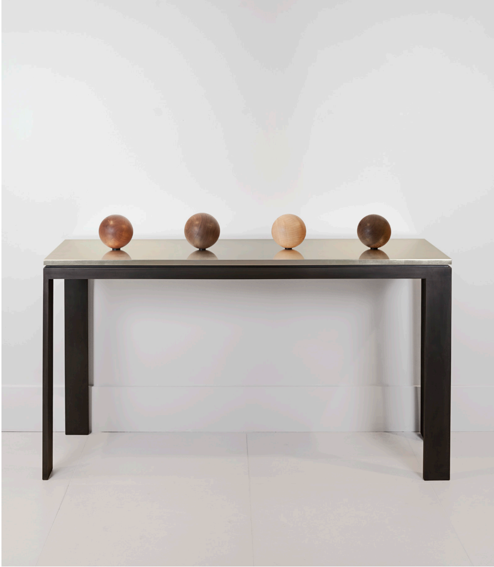
STAL CONSOLE 55W X 16D X 33H